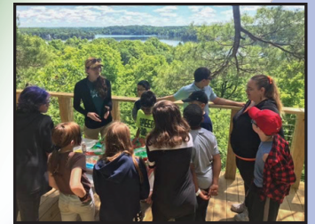
Butterfield Lake Overlook Deck