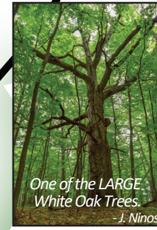
One of the LARGE White Oak Trees. - J. Ninos