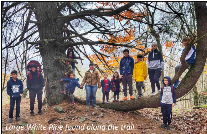
Large White Pine found along the trail

Watch for wildlife along this section of trail! White-tailed deer, Ruffed Grouse, and Pileated Woodpeckers are common.