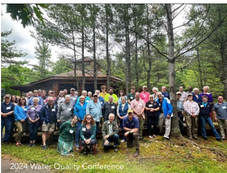
2024 Water Quality Conference