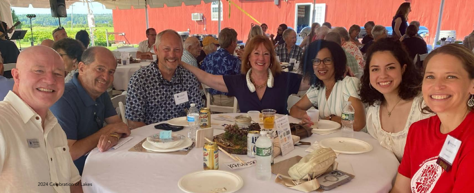
2024 Celebration of Lakes