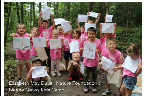
Elizabeth May Duvall Nature Foundation's Nature Grows Kids Camp