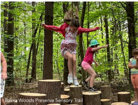
Baker Woods Preserve Sensory Trail

These businesses not only provide employment for local communities but also supply the much-needed goods and services that improve our quality of life—whether that be building supplies, home improvements, medical services, or a place to relax and enjoy good food and friendship. All of this is most beneficial when the air, water, and land around us remain clean, healthy, and beautiful.