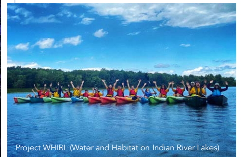
Project WHIRL (Water and Habitat on Indian River Lakes)