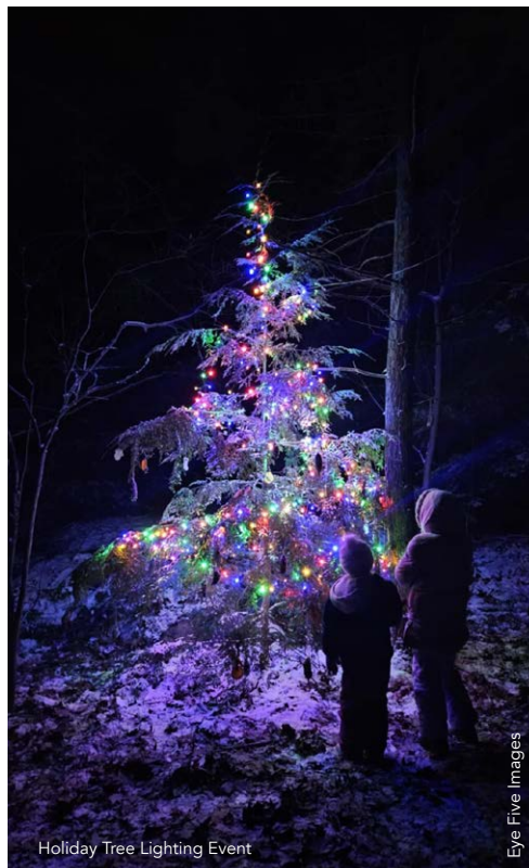
Holiday Tree Lighting Event

Business-community partnerships are critical to achieving a quality of life that encourages collective involvement in building a better environmental society. Like most land trusts, we are a nonprofit organization. Our projects, programs, and initiatives rely on the financial support of others, and local businesses provide the much-needed funding to sustain our mission and continue offering our services to everyone—now and into the future.