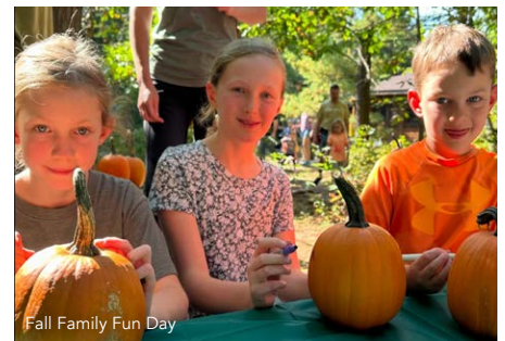
Fall Family Fun Day

From our widely recognized Water Quality Conference to our annual Holiday Tree Lighting Event—and everything in between—we strive to educate and nurture a deeper understanding of how we all play a vital role in sustaining and improving our natural environment.