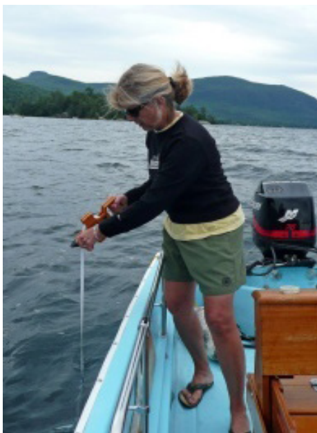
A CSLAP volunteer measures Sechi Depth. The transparency of the water is measured by lowering the disk and measuring the depth at which it ceases to be visible.

In 1985, the New York State Citizens Statewide Lake Assessment Program (CSLAP) was established as a cooperative program between the New York State Department of Environmental Conservation (DEC) and New York State Federation of Lake Associations (NYSFOLA). CSLAP has three major objectives: collect lake data for representative lakes throughout NYS, identify lake problems and changes in water quality, and educate the public about lake conservation. Trained CSLAP volunteers collect lake data following approved sampling methods and send water samples to a certified lab