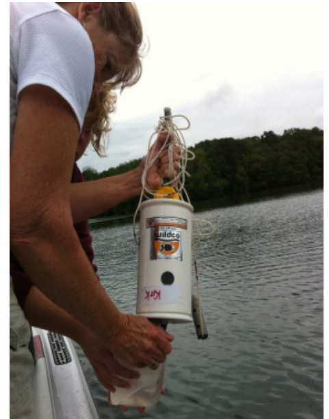
A Kemmerer sampler is used to pull water from a lake. This device allows CSLAP volunteers to easily obtain a sample from a specific depth without risk of contamination as the sample is collected.

The information collected by dedicated volunteers has become the state’s primary lake water quality dataset and has recently expanded to include harmful algal bloom monitoring. More importantly, CSLAP volunteers want to know more about lake management. They ask the questions: Why are there more weeds? What do we do to stop these algae blooms? What does the CSLAP data tell us? Working on answers to these questions, lake associations in