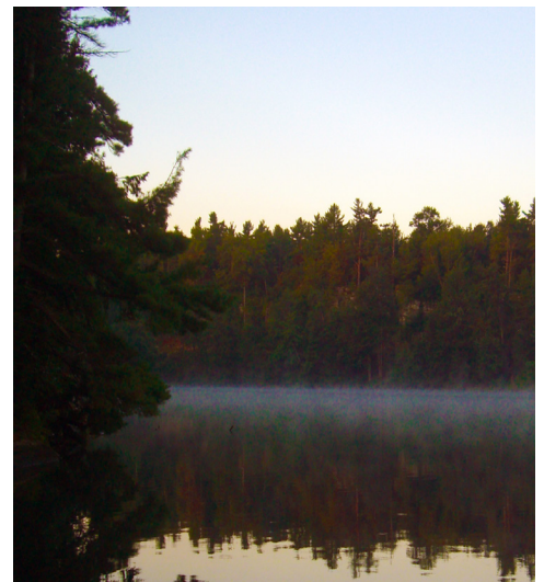
Misty morning reflections on Sixberry Lake.