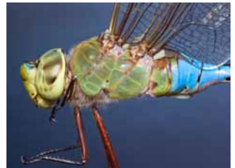
Mature male Green Darner.

By September, the offspring of the migratory type have emerged and are building up energy supplies, getting ready to head south. Coinciding with bird migrations and aided by cool northerly winds, massive swarms of Common Green Darners fill the autumn air pursued by American Kestrels and other birds who use them as a handy food source. After flying, on average, 40 miles per day, they end their migration, having flown hundreds to thousands of miles. Eggs are laid, hatch and in about 3 months the nymphs have matured ... they emerge as adults and are soon heading north ... returning to our wetlands in the spring.