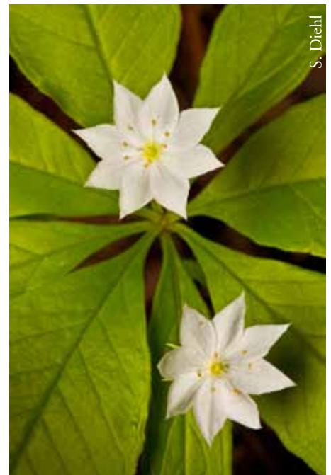
Starflower on Millsite Lake

Formed in 1998 to conserve critical lands in the Indian River Lakes area of Northern New York, the IRLC is a non-profit land trust with 501(c) (3) tax exempt status operating in a manner consistent with the published standards of the Land Trust Alliance, a national organization