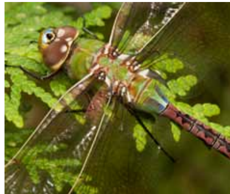
Female Green Darner with mauve abdomen