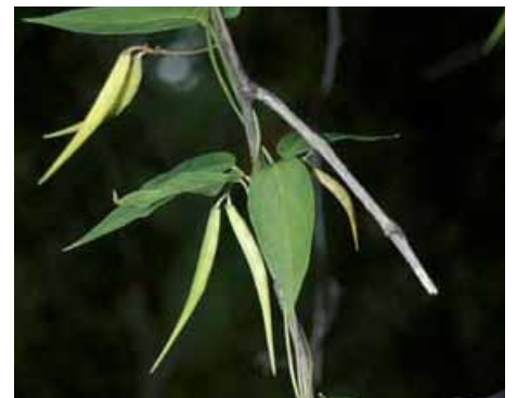
Swallow-wort pods form abundantly in July and August

Contact Cornell Cooperative Extension of Jefferson County at 788-8450 with questions about swallow-wort biology, specifics on removal or chemical controls.