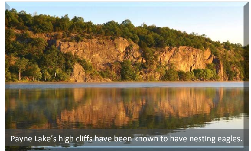
Payne Lake's high cliffs have been known to have nesting eagles.

Payne Lake is located in the Village of Antwerp, just outside the hamlet of Oxbow. Early settlers used to speak of the lake on the Oxbow Road as Vrooman's Lake, after the early hunter and settler who is one of the men credited with the founding of the hamlet of Oxbow. Peter Vrooman built a log house on the big bend of the Oswegatchie River in the early 1800s which he opened as a public house for travelers making their way through the new country. Roselle Payne built a steam sawmill on the shore of the lake in 1850. The mill cut hemlock for the plank roads that were being constructed around the area. As time went people in the area started to refer to the lake as Payne Lake.