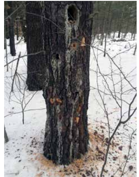
Pileated woodpeckers have been busy on the Redwood Hill Preserve this winter.

I am very pleased to introduce the launch of the IRLC Volunteer Information Center. Our Committee leaders have prepared a number of mini job descriptions to assist you in finding a rewarding way to help the Indian River Lakes Region while working with your friends and neighbors. A wide variety of job postings are included in this newsletter and many more will be posted on our web site soon.