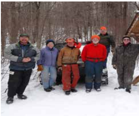
There are many ways to give. Volunteers help with trail maintenance and special events, lead hikes, enter data and much more!