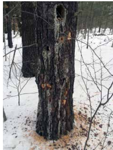
Pileated woodpeckers have been busy on the Redwood Hill Preserve this winter.

I am very pleased to introduce the launch of the IRLC Volunteer Information Center. Our Committee leaders have prepared a number of mini job descriptions to assist you in finding a rewarding way to help the Indian River Lakes Region while working with your friends and neighbors. A wide variety of job postings are included in this newsletter and many more will be posted on our web site soon.