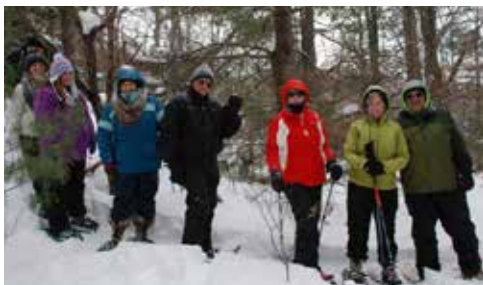
Your support helps maintain and build new trails, provide programs and events and manage preserves.

This list represents contributions made between January 1, 2015 and December 31, 2015. We value the contributions of all our donors and regret any errors or omissions. Please contact us if your name should appear on this list. Thank you for your generous and continuing support!