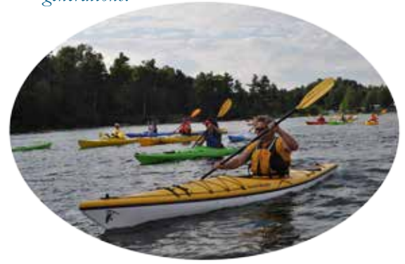
Thanks to your support, the Indian River & Lakes Water Project is making great progress for water quality.