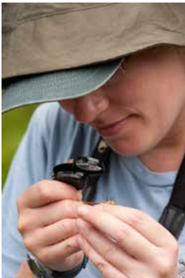
A naturalist identifies an insect during a BioBlitz.

We encourage everyone to stop by the Redwood Hill Preserve on June 18th to get involved with the excitement. As plans solidify for public programs throughout the event, we will update our website. For more information about the Adirondack All-Taxa Biodiversity Inventory, visit their Facebook page at https://www.facebook.com/AdirondackATBI/ .