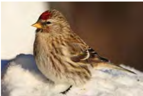
The female has a white chest, streaked sides and a red cap.

Common Redpolls are true northerners with their breeding range in North America extending