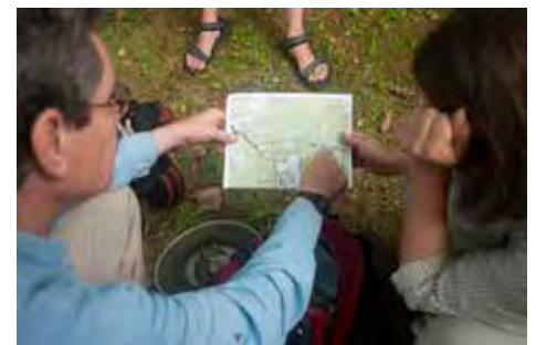
TWIG leaders identify areas to inventory during a past BioBlitz.

spend a full day hiking IRLC preserves and boating the lakes and river to observe butterflies, dragonflies, plants, fungi, mammals, amphibians, and other organisms small and large. Families are welcome to join us Friday, June 17th