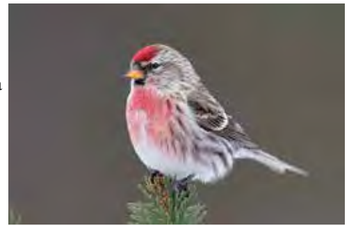
Common Redpoll males have a pale red vest on the chest.

Before irruptions into our area are possible, the population levels must exceed available food resources and successful breeding plays an important part in the process. Breeding occurs in open forested areas with birds avoiding dense closed forest. The female does most of the chores of raising young from nest building to nest sanitation and feeding the brood. Usually four to six eggs are laid and hatch in about eleven days. The young are ready to leave the nest after another eleven days and are soon on their own. Unlike young hawks and fish-eating species, these young usually have readily available food sources and catching seeds is not that hard. Usually only one brood is raised per year but in good years successful parents may try a second nesting. The short summer at high latitudes, weather, predation and food resources are primary constraints on nesting success. The usual vegetarian diet of this species is supplemented