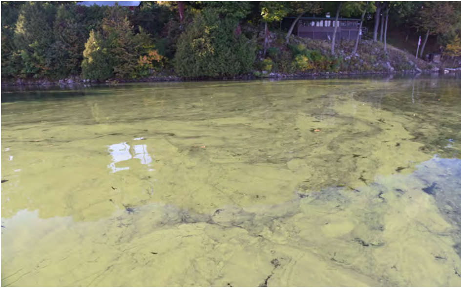
Algae blooms like this one on Butterfield Lake, summer 2014, are becoming an all too frequent occurrence on the Indian River Lakes. These blooms result from excess nutrients entering the lake water and can often contain species of algae that are toxic to humans, pets and wildlife.

The Indian River and Lakes Water Project has generated a lot of interest as we build a wide ranging program of activities to overcome the challenges presented by the water quality crisis that is degrading the way of life on the Indian River and Indian River Lakes we all love. As we talk with and listen to more and more of you who live in, and love, this area it has become clear that the community understands there is a water crisis. A significant number of individuals are clearly ready to begin taking action to restore clean water to our lakes and river.