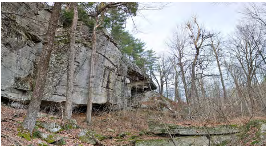
Rock ledge on the new Redwood Hill Preserve.