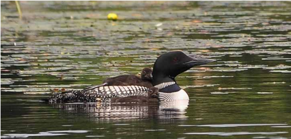
A new family of loons on Grass Lake.

With unrelenting news of environmental destruction elsewhere, we hope you can take comfort in the work that you have done, through your support of the Indian River Lakes Conservancy, to preserve and protect the beautiful landscape in your own back yard.