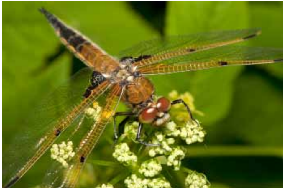
4-Spotted Skimmer (Libellula quadrimaculata)

River. The Four-spotted Skimmer has continued to interrupt our plans. We were trying to garden in our back yard a week after visiting Millsite Lake. One flew overhead... the hoe and rake were dropped and off we went with sweep nets in hand. We feel privileged to have Four-spotted Skimmers in our Indian River watershed.